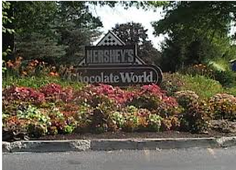
Hershey's Chocolate Company

Milton Hershey is remembered as someone who built an entire city and helped people get jobs. He is remembered for someone who made a school for children who did not have families. He is someone who made a medical center to help those who are sick and someone who made that chocolate, that yummy chocolate that most of us throughout the world enjoy.