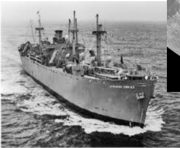
A WWII liberty ship named in Miss Mitchell's honor

Maria Mitchell is well-known for her quote , "We have a hunger of the mind. We ask for all of the knowledge around us and the more we get, the more we desire." She truly loved learning and she truly was a great astronomer.