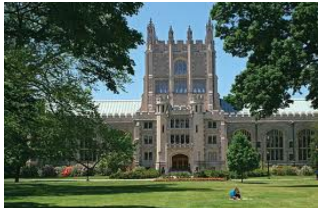
Vassar College today