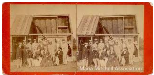
Early years of Vassar College

Maria became professor of astronomy at Vassar College in 1865 and was named Director of the observatory there. Maria soon realized that she was paid much less as a woman professor. She demande d that the college pay her just as much as the men professors. Guess what? After asking for more money, she eventually received the same pay as the men professors.